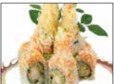
Lai Lai Special Roll