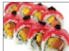
Tuna Lover Roll

Food Allergies? If you have a food allergy, please speak to the owner, manager, chef or your server