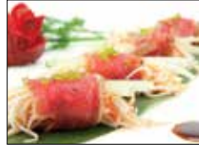
Wawa Tuna Special