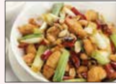
Szechuan Peppercorn Chicken