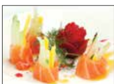
Salmon Mango Salsa