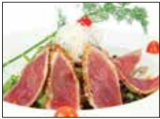
Pepper Tuna Tataki Salad