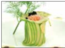
Spicy Tuna Bowl