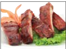
B.B.Q Spare Ribs