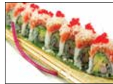
Spicy Girl Roll