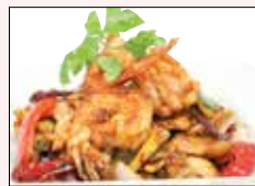
Szechuan Peppercorn Prawn