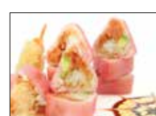
Pink Lady Lover