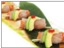
New Style Spicy Tuna