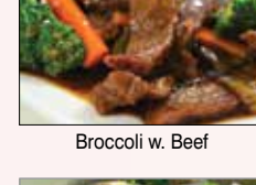
Broccoli w. Beef