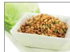
Chicken Lettuce Wrap

* Consuming raw or undercooked meats, poultry, seafood, shellfish, or egg may increase your risk of foodborne illness, especially if you have certain medical conditions