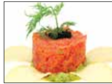
Spicy Tuna Tartar