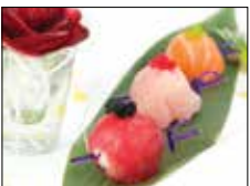
Tri-Color Sushi Ball