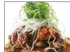
Crispy Red Snapper