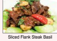
Sliced Flank Steak Basil