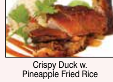
Crispy Duck w. Pineapple Fried Rice